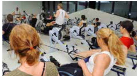
Over 120 sports are offered in the ASVZ sports centres and in other city and cantonal facilities.