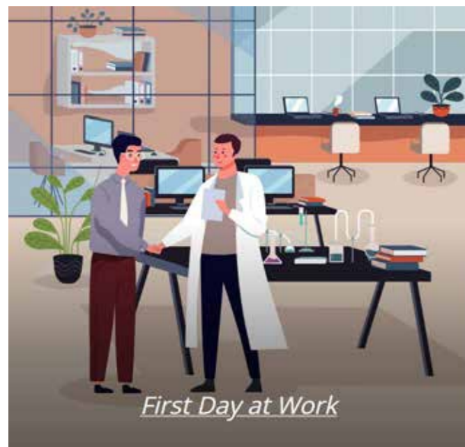
The "Survival Guide" is organised according to the timeline of a typical doctoral study period.