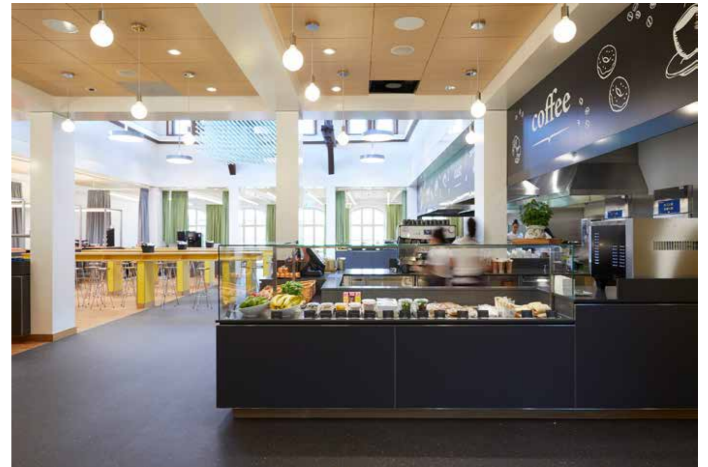
The Food&Lab at CAB offers street and world food (hot and cold), homemade and healthy vitamin bombs, salads, sandwiches, coffee and bakery. It is part of the "Sustainable Gastronomy Project" and thus supports the long-term development towards sustainable gastronomy at ETH Zurich.