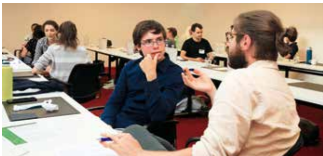
The VMI summer retreat is both a social occasion and a platform for scientific exchange among the department's scientific staff. Don't miss it!

We are dedicated to promoting personal and scientific growth by organizing a variety of social and academic events. These events allow our members to get to know the department and their colleagues better, learn new things, and simply have some fun.