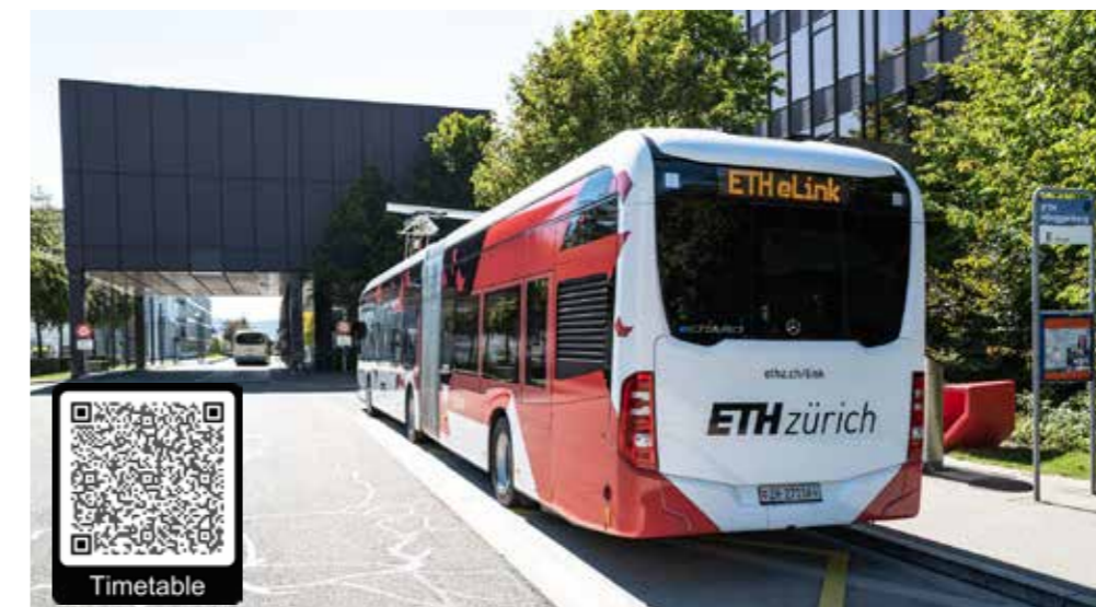
Every day, hundreds of ETH members commute between the Zentrum and Hönggerberg campuses by the electrically powered eLink shuttle bus.

Check out attractive offers and services in the "Offers and Benefits" section on page 22.