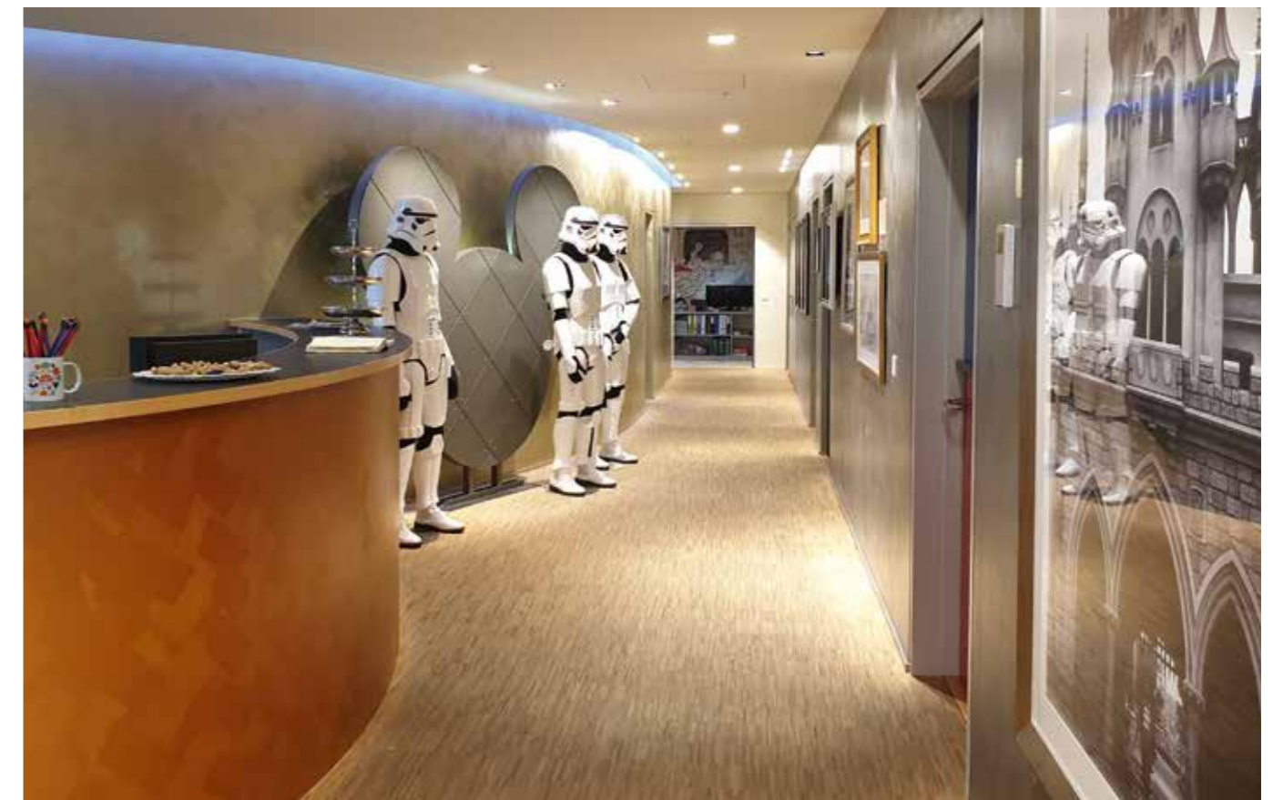
Founded in 2008 and located in Zurich, close to our buildings STD, STF and WWA (see page 10), DisneyResearch|Studios (DRS) is part of a broad innovation ecosystem and partners closely with ETH Zurich and our department.