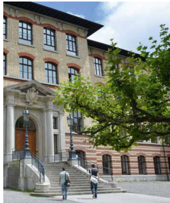
The department's main building, CAB, was originally built in 1886 to house ETH's chemistry department. The listed building retains much of its original character, including the historic chemistry lab, which has been preserved and serves as a study space today.

The roots of ETH Zurich go back to 1855, when the founders of modern Switzerland created this place of innovation and know-